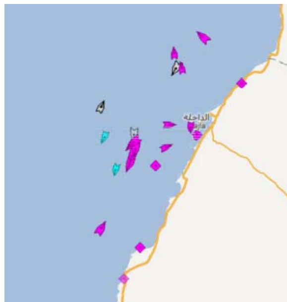
AIS-emitting fishing vessels around Dajla (Al Dakhla) on 17-august-2011